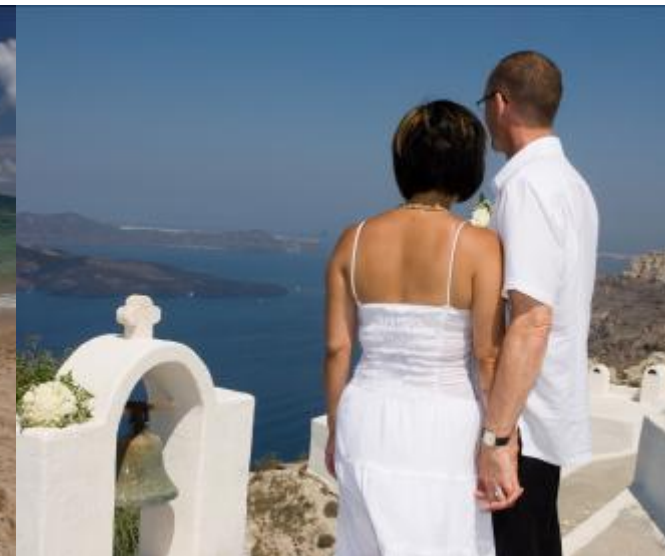
Greek White Top Villa Wedding