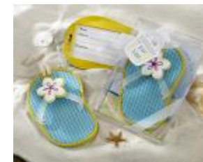
Flip Flop Luggage Tags