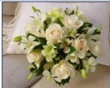
Standard Harmony Bouquet