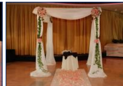
Upgraded Ceremony Arrangements