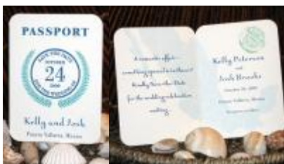
Passport "Save The Date" Invite