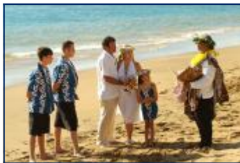
Hawaiian Romance Starting from $2,795.00