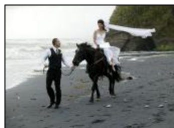
Horseback Riding Romance Starting from $2,595.00