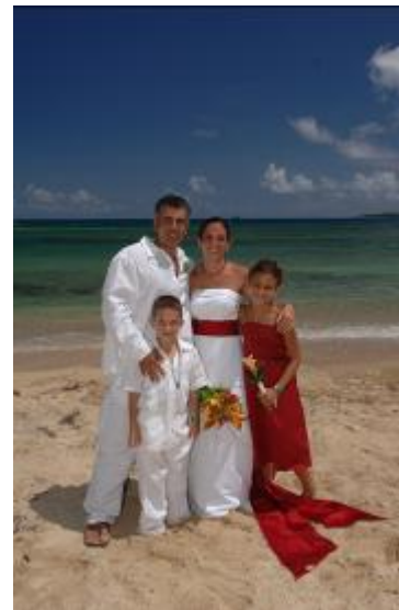
St. Thomas Wedding