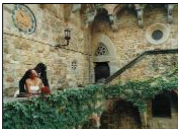
European Romance Starting from $3,295.00