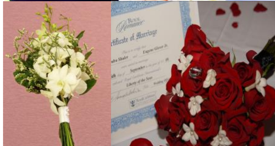
Standard Duet Dendrobium Flowers