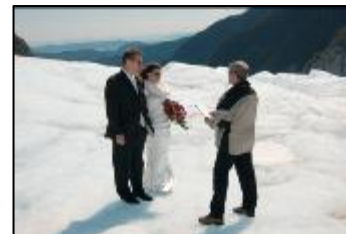
Glacier Romance Starting from $4,595.00