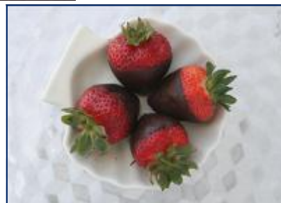
Standard Toasting Strawberries