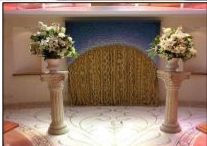
Standard Ceremony Arrangements

**** Please contact your Stateroom Attendant to arrange the delivery of this amenity.