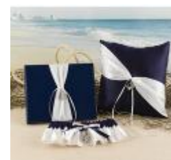
Anchors Away Ceremony Set