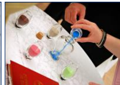
Enhancement Option - Sand Ceremony