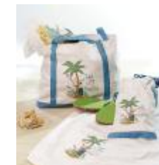
Let The Fun Begin Gift Set