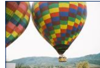
Hot Air Balloon Romance Starting from $4,295.00